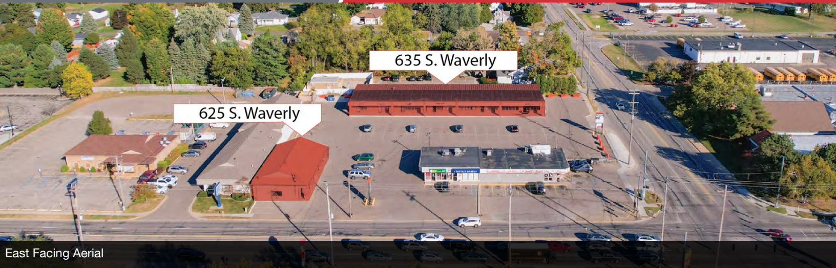
East Facing Aerial