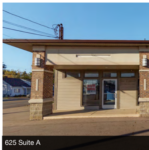
625 Suite A