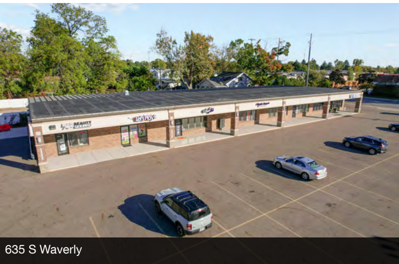
635 S Waverly