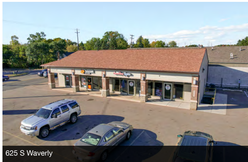
625 S Waverly