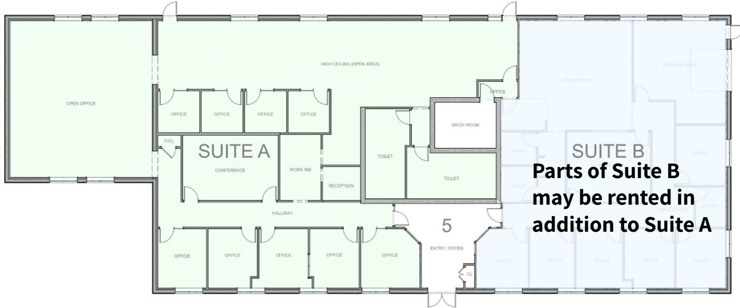
SUITE A 5,088 SF