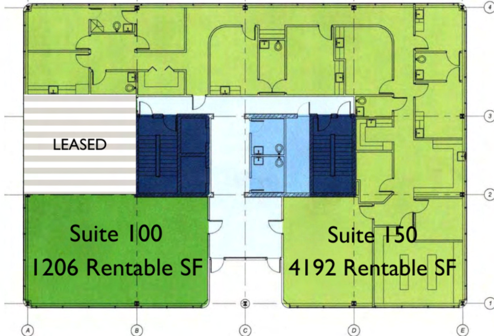
FLOOR PLAN - FIRST LEVEL