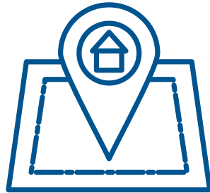
11 Single Family Lots