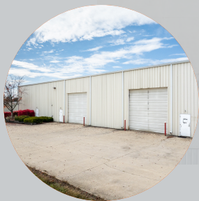
4 GRADE LEVEL DOORS