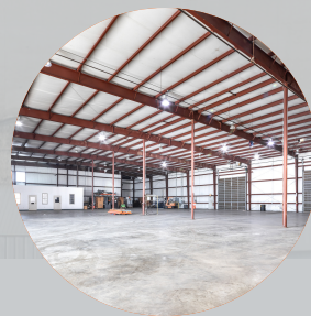
22' CLEAR HEIGHT