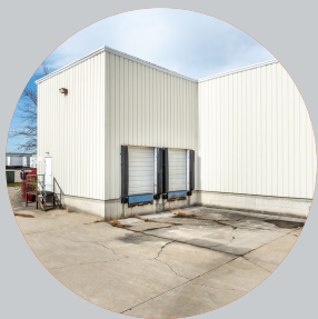
2 DOCK HIGH DOORS