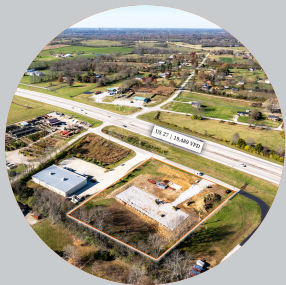
HIGH VOLUME AREA