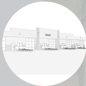
$12 SF/YR (NNN)