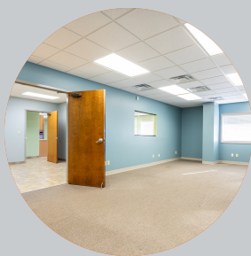
CLEAN OFFICE SPACE