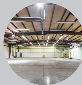
17.5' CLEAR HEIGHT