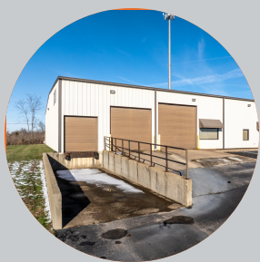
1 DOCK 2 DRIVE-INS