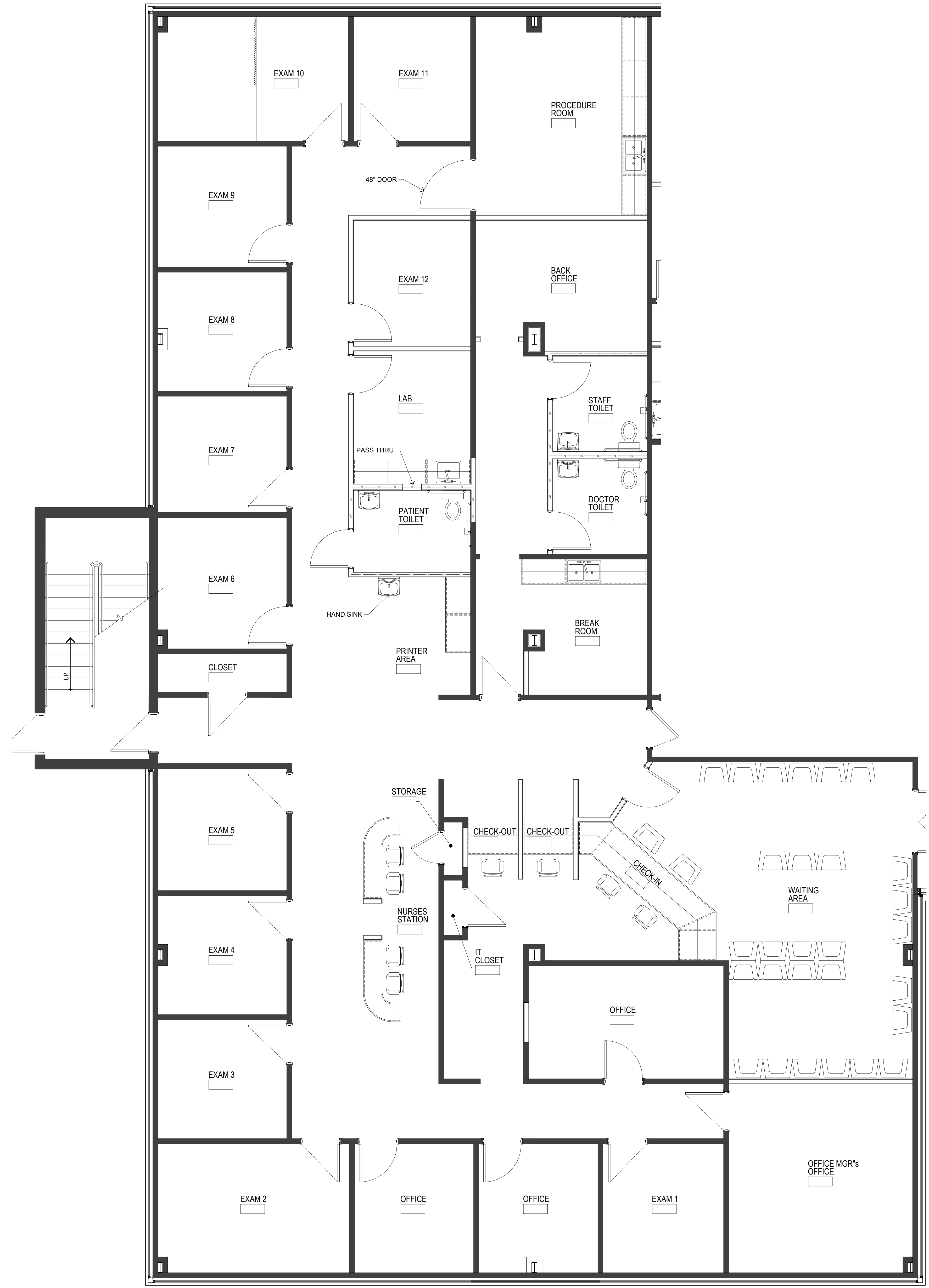
FLOOR PLAN 1/4" = 1'-0" SCALE