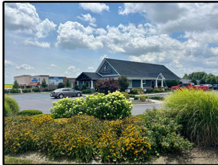
Skipworth Vet Clinic