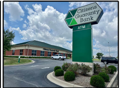
Citizens Guaranty Bank