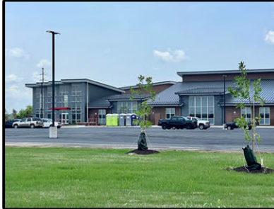
Richmond Career and Technology Center