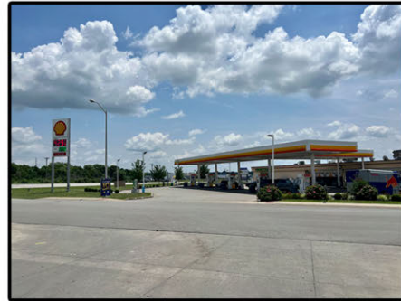
Shell Gas Station