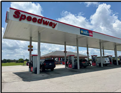
Speedway Gas Station