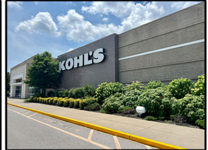
Kohl's Department Store