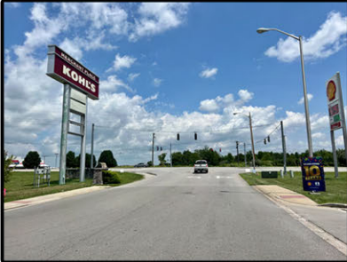
Merchant Place Entrance/ Traffic Signaled Access