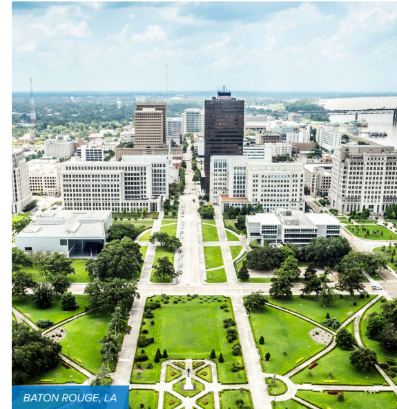
BATON ROUGE, LA