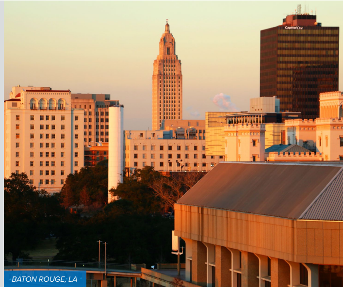
BATON ROUGE, LA

The Port of Greater Baton Rouge is the 8th-largest in the United States in terms of tonnage shipped and is the farthest upstream Mississippi River port capable of handling Panamax ships. This, as well as its status as a major port city, is largely due to the Huey P. Long - O.K. Allen Bridge, which was intentionally constructed under the governorship of Huey Long at a low height, preventing big tankers from making their way up-river, past Baton Rouge.