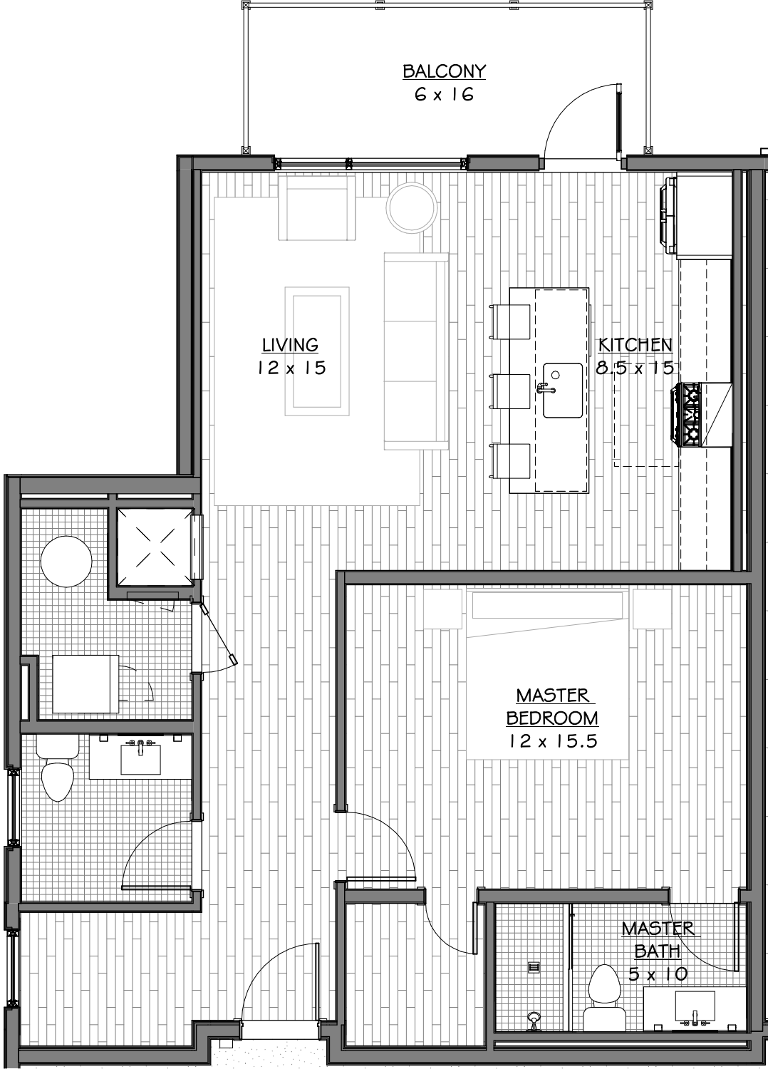
1 UNIT 421 (4TH-5TH FLOORS) 3/16" = 1'-0"