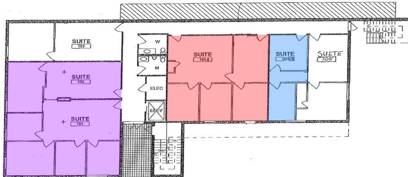
1 FIRST FLOOR PLAN