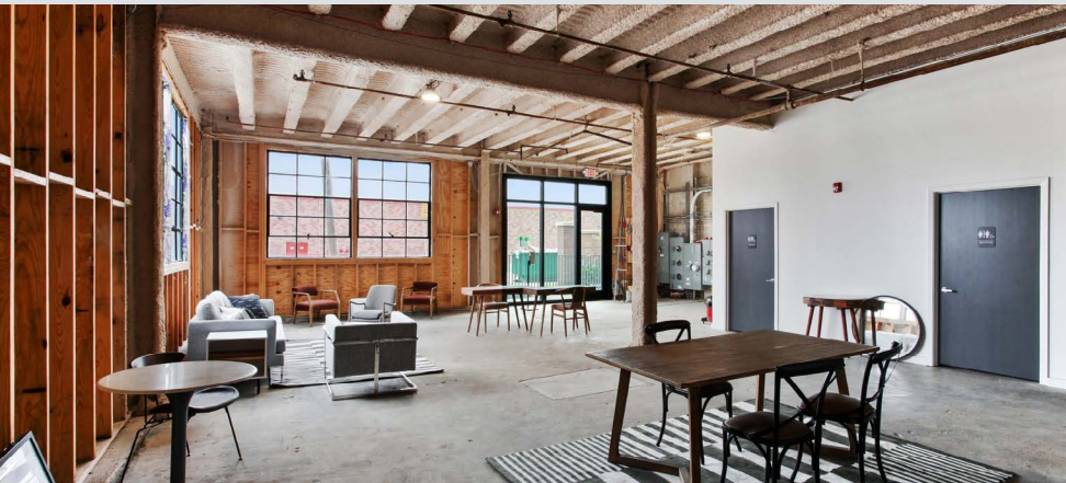
1ST FLOOR WAREHOUSE/OFFICE