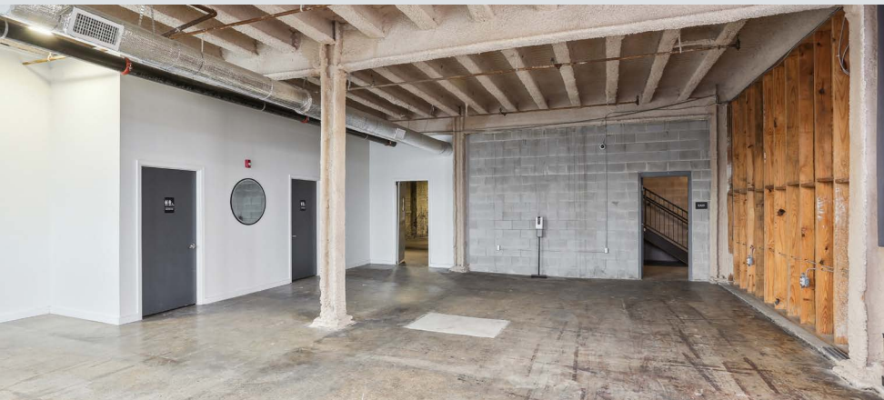
1ST FLOOR WAREHOUSE/OFFICE