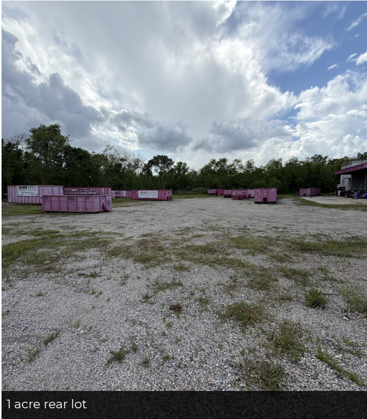
1 acre rear lot