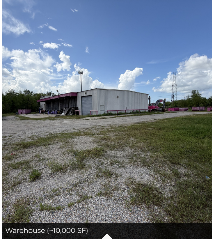
Warehouse (~10,000 SF)