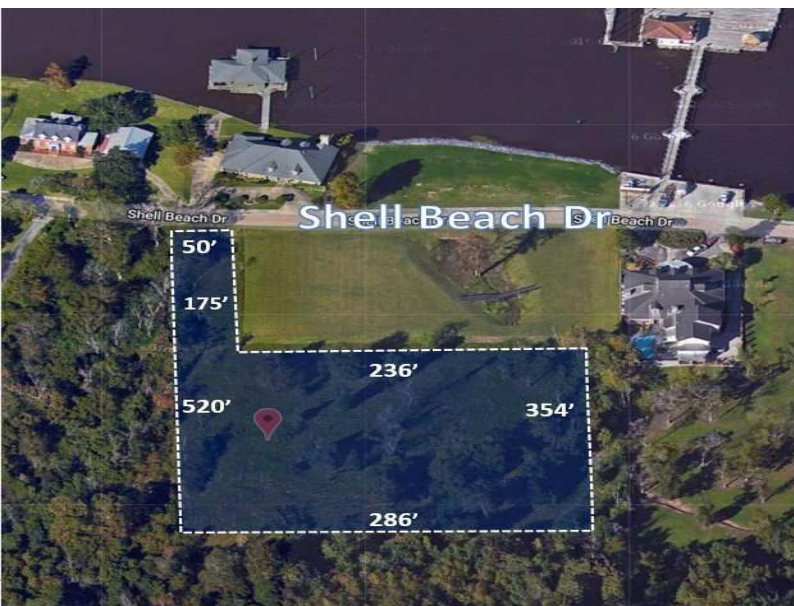
Outline of 2.44 acres with measurements. Facing North

A combined purchase of this parcel with one or both of the adjoining properties offers great potential for a pretigious subdivision.