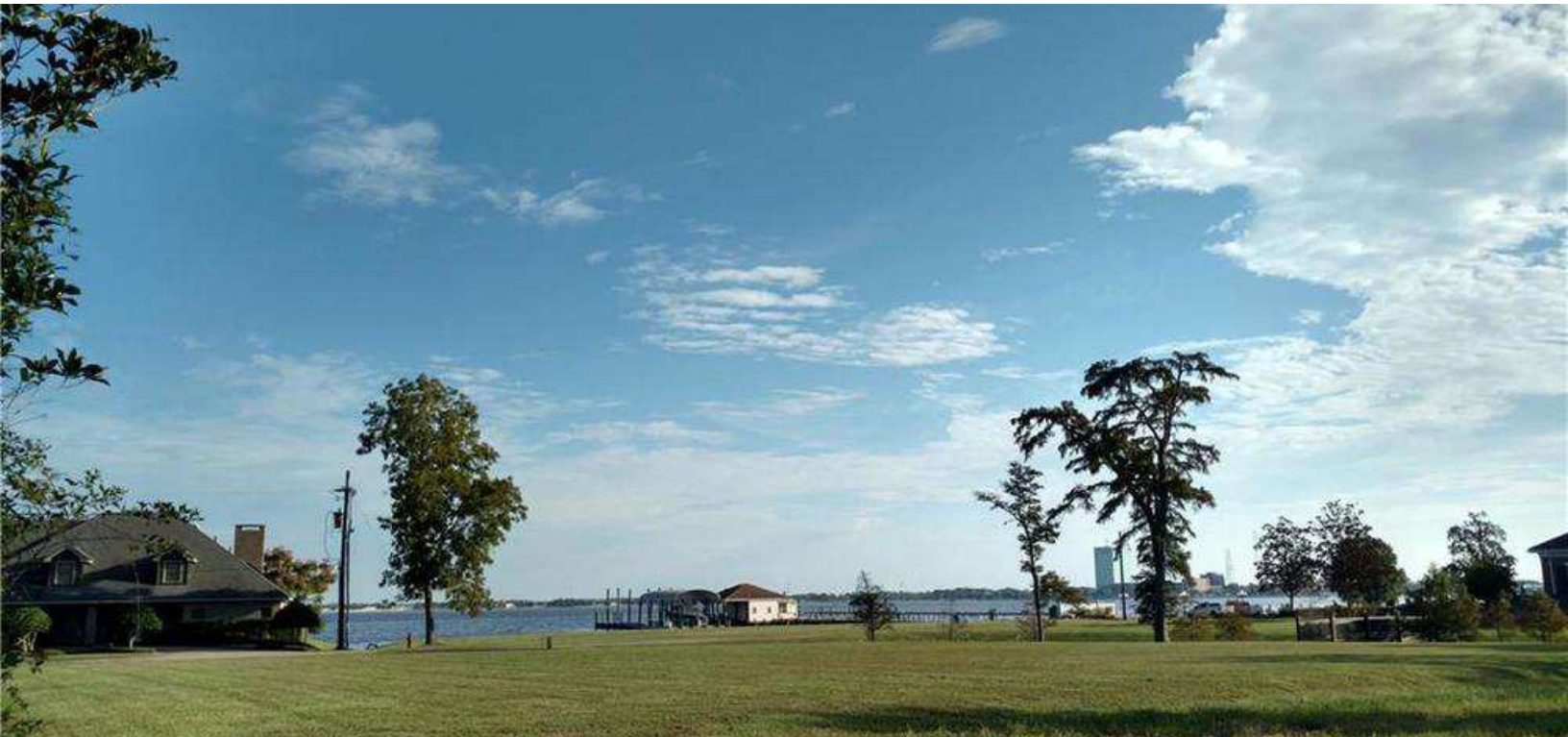
Photo taken from the NW corner of the homesite. The lot in the foreground offers riparian rights and is for sale via a separate listing.

TBD Shell Beach Drive, Lake Charles, LA 70601