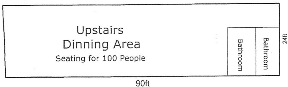
Seafood World Upstairs [Area: 2170 ft 2 ]