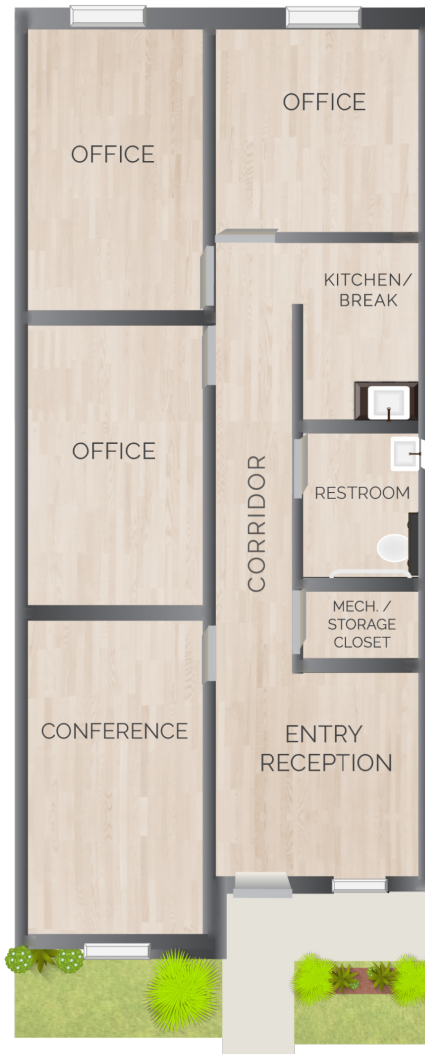
OFFICE SPACE PLAN