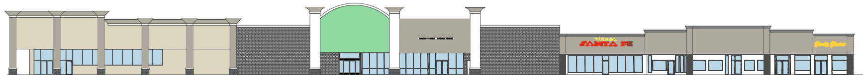
rendering of proposed improvements