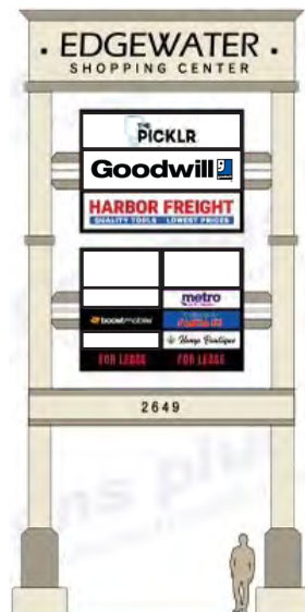
rendering of proposed new pylon signage

Walmart Supercenter Dillard's JCPenney Belk Books-A-Million