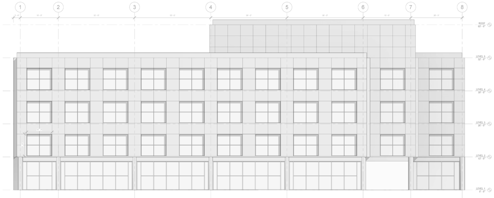
1 ELEVATION - NORTH A300 1/8" = 1'-0"