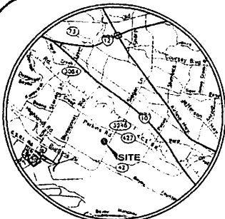
VICINITY MAP SCALE 1" = 2000'