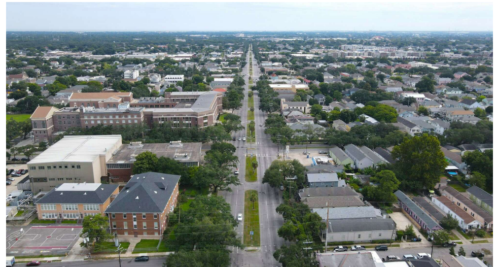
Looking north down Carrollton Avenue