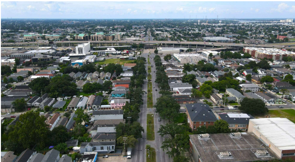
Looking south down Carrollton Avenue