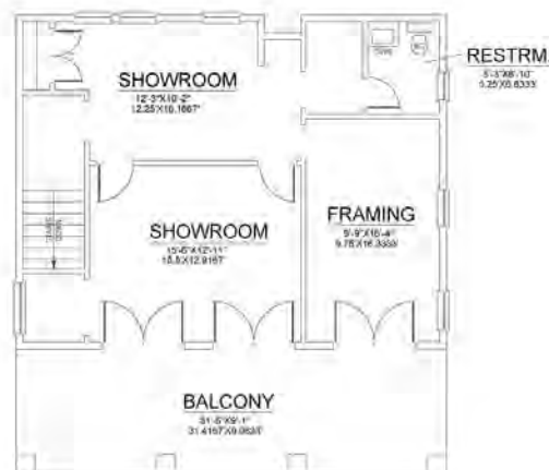
Floor Plan: 545 S. Foster Dr.