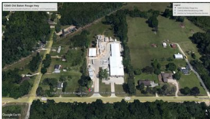
Old baton rouge space