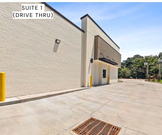
SUITE 1 (DRIVE THRU)