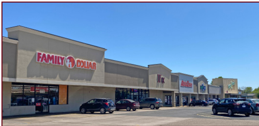
Adjacent Shopping Center