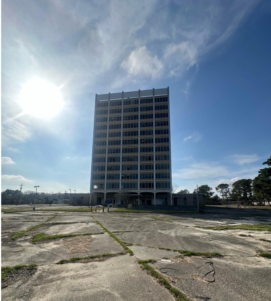
Site Photo (02/2025)