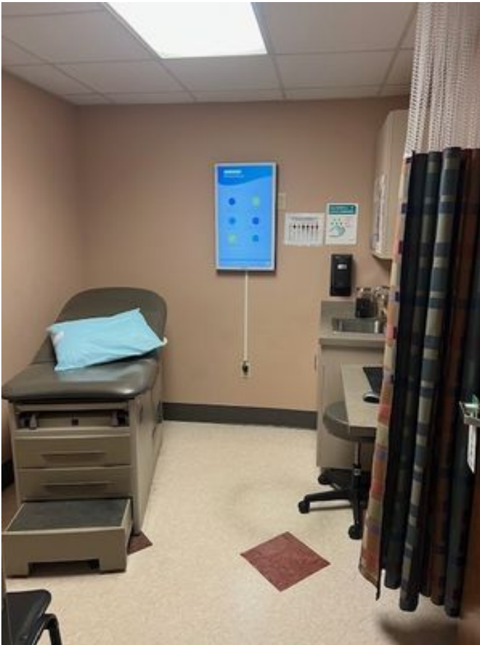
Exam Room 2