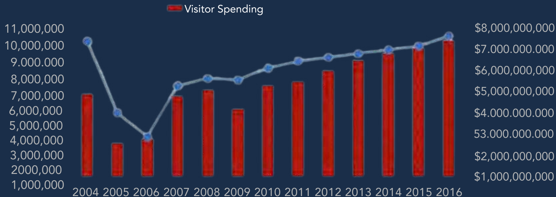
New Orleans Visitation Statistics

New Orleans has always been considered a top destination for its historic charm and vibrant music scene, but there has been a noteworthy boom in the tourism industry over the previous decades. Since 2009, New Orleans has witnessed a steady rise in both visitors and visitor spending, with each consecutive year outperforming the last. Through 2022 (the most recent data available), total visitor count and spending are approaching pre-pandemic levels. Clearly, local tourism demand has regained momentum and is well on its way to a full recovery. To highlight the strength of the pre-pandemic hospitality market, we point to the following historical visitor and spending data.