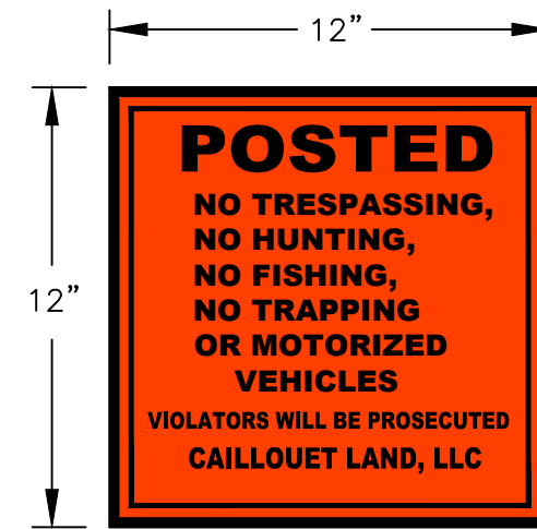
CAILLOUET LAND, LLC POSTED SIGN (TYP)