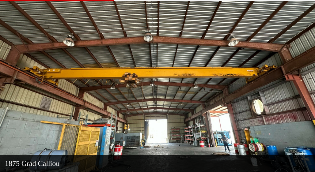
1875 Grad Calliou