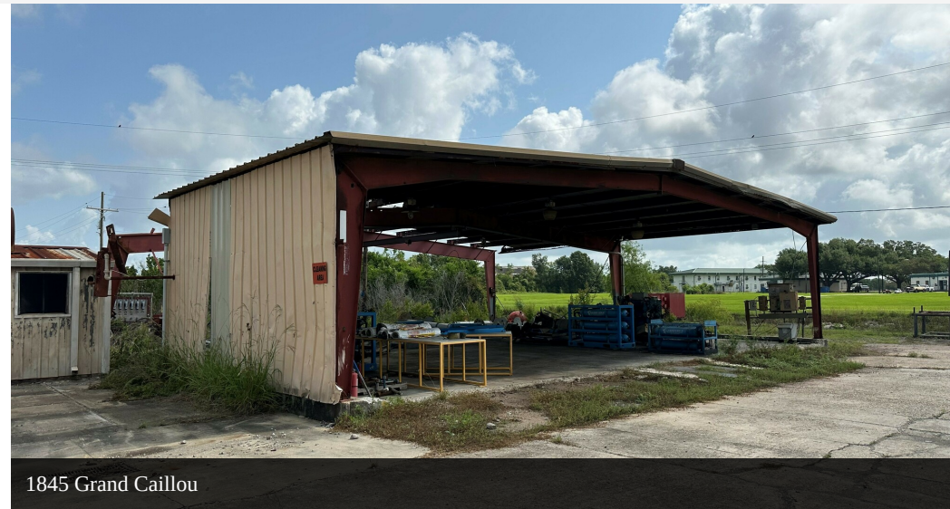
1845 Grand Caillou