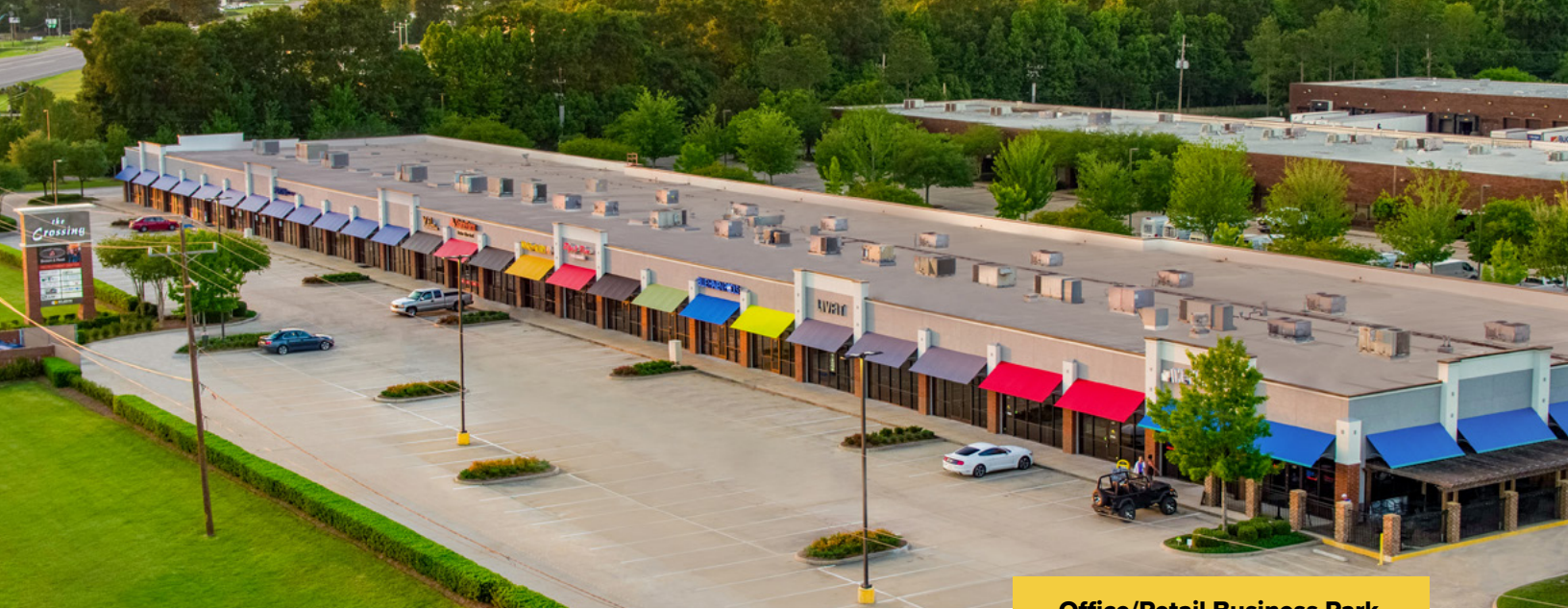
Office/Retail Business Park