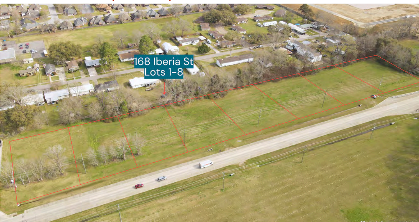
*Property lines are approximate

3.88 ACRES OF PRIME COMMERCIAL LAND NOW AVAILABLE FOR SALE IN THE HEART OF YOUNGSVILLE.