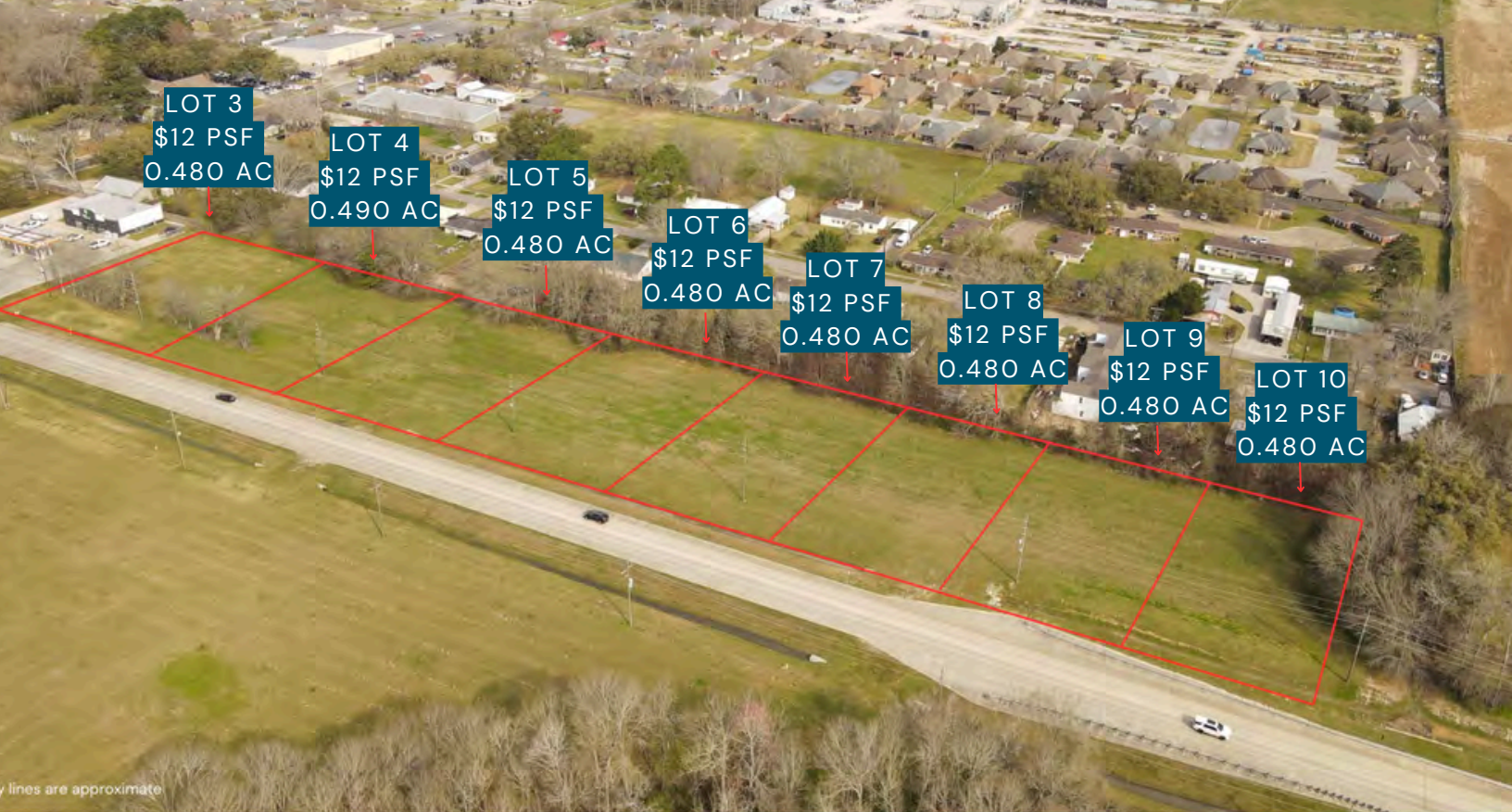
Property lines are approximate