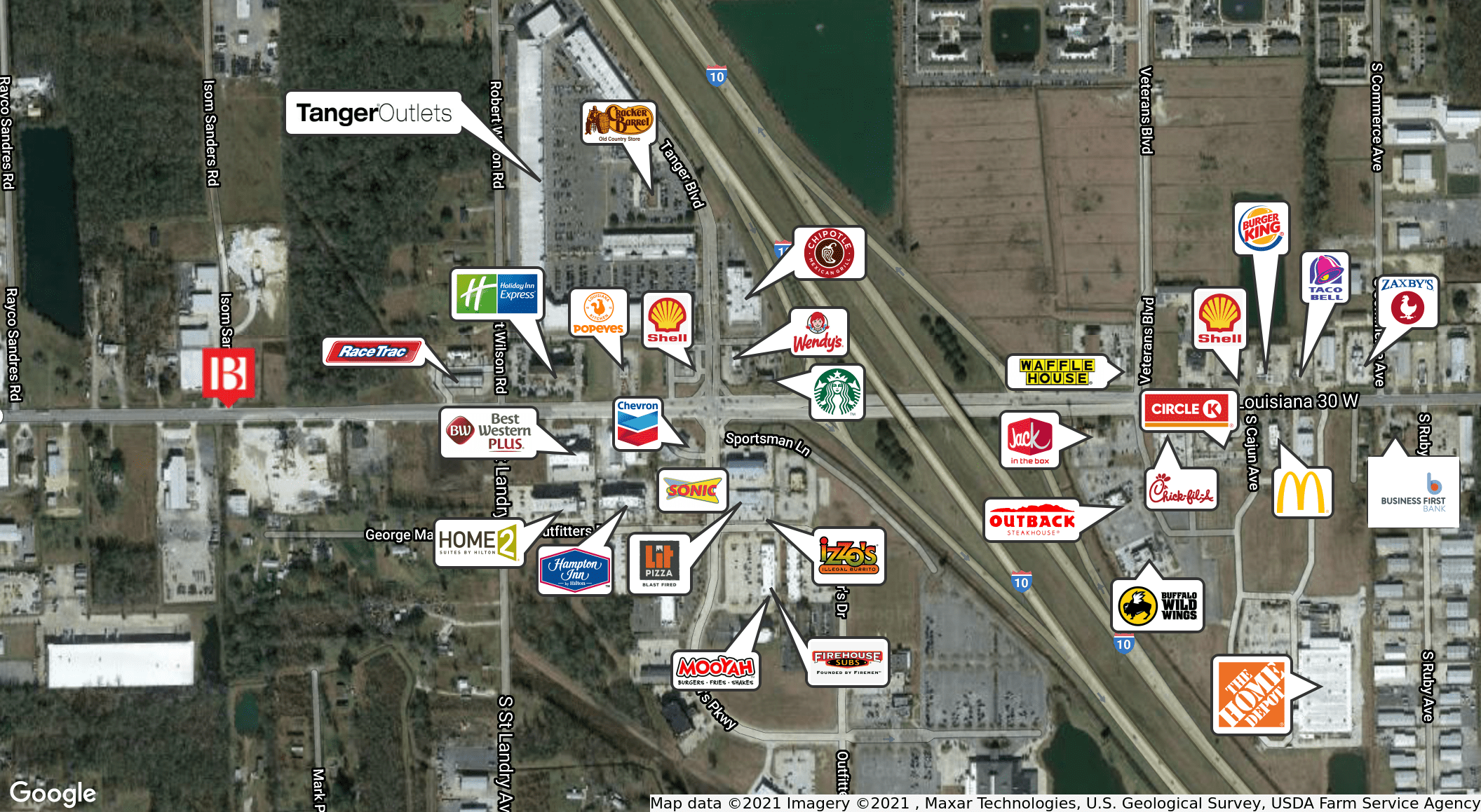
Map data © 2021 Imagery © 2021, Maxar Technologies, U.S. Geological Survey, USDA Farm Service Agency