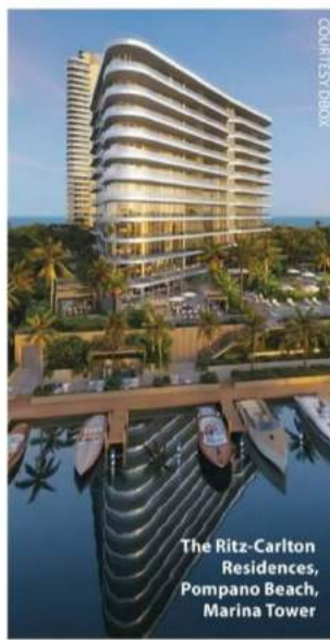
The Ritz-Carlton Residences, Pompano Beach, Marina Tower