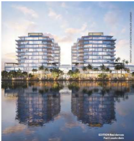
EDITION Residences Fort Lauderdale

Sales have launched at EDITION Residences Fort Lauderdale, a project consisting of two 11-story towers with cascading facades that's under development by Location Ventures and Akaviv International's EDITION Hotels. The 65 spacious residences will include two-bedroom and four-bedroom floor plans ranging from 1,710 to 4,660 square feet, along with nine villas and four penthouses. Prices start at $3 million.