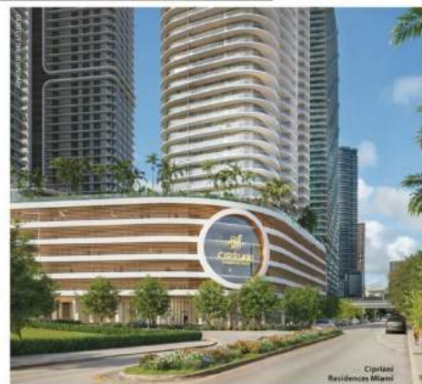
Cipriani Residences Miami

Cipriani Residences Miami is the hospitality brand's first ground-up residences in the United States. The project includes an 80-story tower with 397 one- to four-bedroom units featuring Italian cabinetry, Wolf and Sub-Zero appliances and expansive terraces. Amenities include a signature Cipriani bar and resident dining area, two swimming pools, a fitness center, playroom, library, spa and wellness center. Prices start at $1.6 million, and completion is expected in 2025.