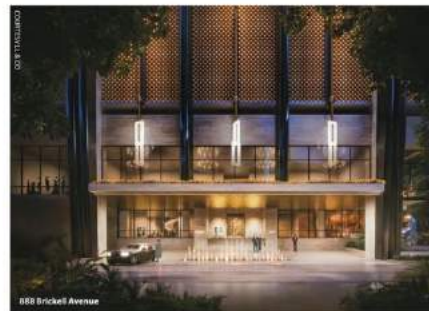
888 Brickell Avenue

2310 SE 17th St. 754-231-3066 piersixtyresidences.com Tavistock Development Co. has launched sales for The Residences at Pier Sixty-Six, where phase one of the project includes 62 luxury condominiums consisting of two- to four-bedroom units starting at $3 million. Construction began in late 2021, and completion is expected in early 2023. Buyer options in the first phase include an 11-story condominium building with 31 residences, each of which will have a private pool, and two four-story buildings with a combined 31 units.