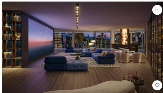
The Marina Tower Entertainment and Wine Lounge