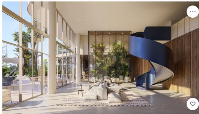
The Marina Tower Lobby