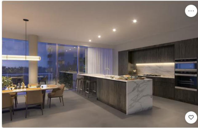
The Marina Tower Residence Kitchen