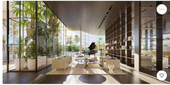
The Marina Tower Bar & Lounge with Piano