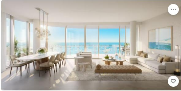
The Beach Tower Living Room