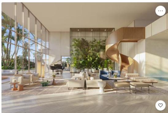
The Beach Tower Lobby Lounge

The Ritz-Carlton Residences, Pompano Beach are not owned, developed or sold by The Ritz-Carlton Hotel Company, L.L.C. or its affiliates ("Ritz-Carlton"). 1380 Ocean Associates, LLC uses The Ritz-Carlton marks under a license from Ritz-Carlton, which has not confirmed the accuracy of any of the statements or representations made herein.