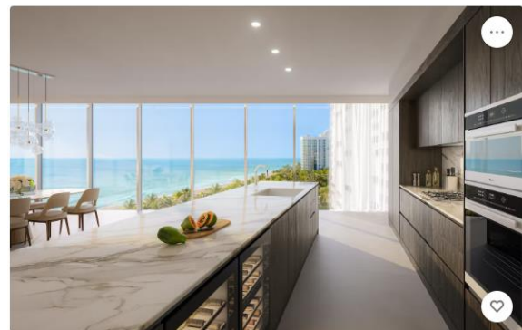
The Beach Tower Residence Kitchen