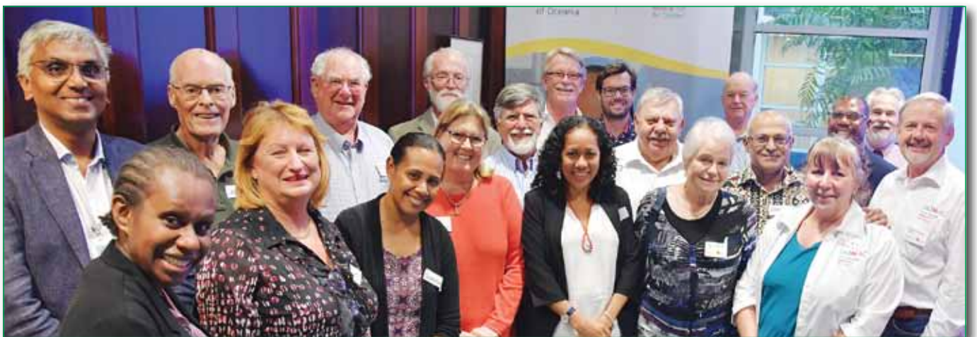
ROMAC Medical Panel April 2019

The Medical Panel looks forward to continuing the wonderful work of ROMAC in the coming year.