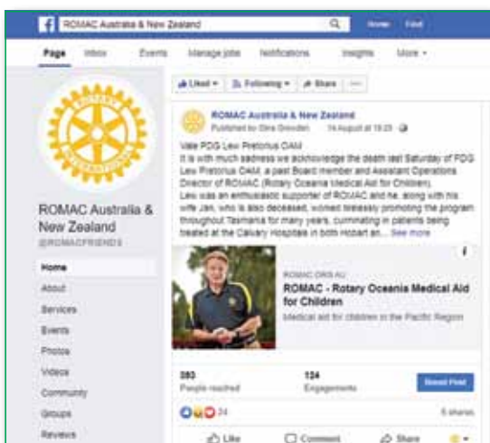
ROMAC Friends Facebook page

All members of the Communications Committee step down in September 2019. We collectively extend our very best wishes to ROMAC for continuing success in bringing needy children from neighbouring countries to Australia or New Zealand for life-saving or transformative surgery.