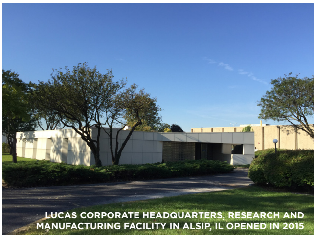
LUCAS CORPORATE HEADQUARTERS, RESEARCH AND MANUFACTURING FACILITY IN ALSIP, IL OPENED IN 2015

R.M. Lucas Company is the developer and producer of professional grade coatings, adhesives & sealants. We are committed to developing new and innovative products to meet and exceed the needs of an evolving construction marketplace. A focus on quality and customer satisfaction for the professional contractor is the foundation of our company and our plan for future success.