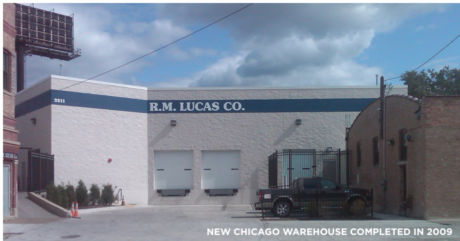
NEW CHICAGO WAREHOUSE COMPLETED IN 2009