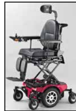
Seat elevator travel range: 30cm/12inch