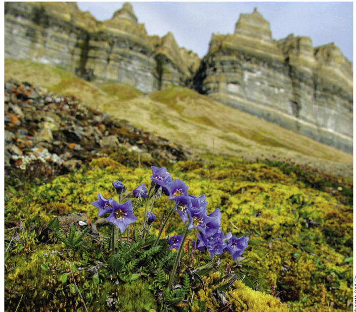
Above: Skansbukta. Left: Polar bear.