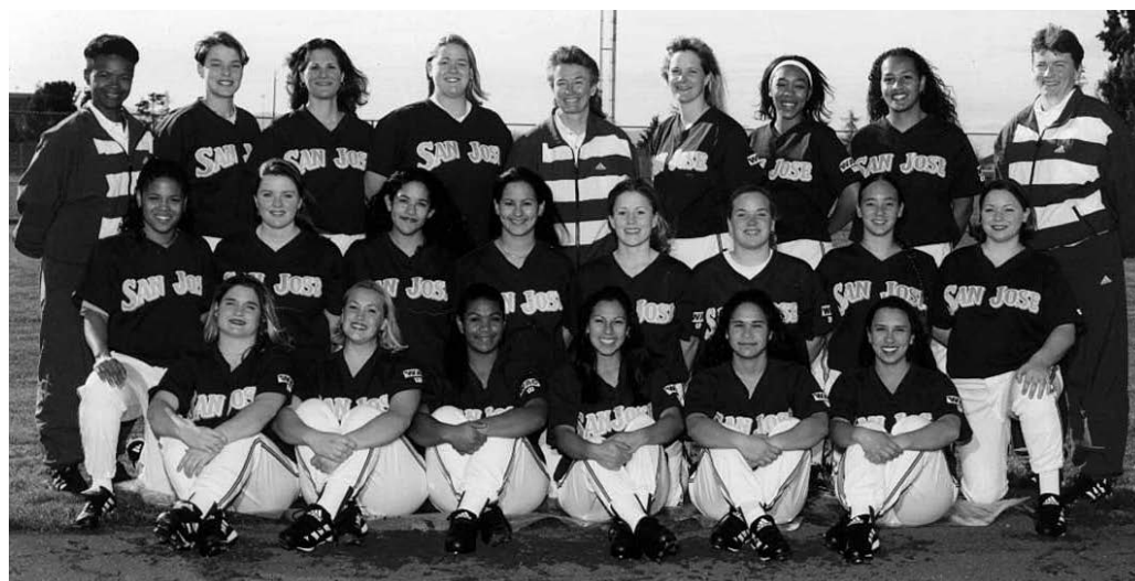
In 1998, the Spartans won three games over nationally-ranked opponents.