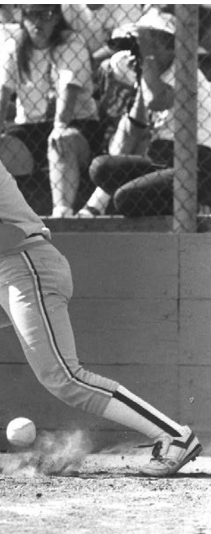
...ee All-Americans in the history ...estowed upon her in 1992. ...n I All-Pacific Region honoree ...d holds the program's single- ...stolen base records. For her ...ducted into the San José State ...f Fame in 2002.

1st Team 2nd Team 3rd Team 4th Team 5th Team 6th Team 7th Team 8th Team 9th Team 10th Team 11th Team 12th Team 13th Team 14th Team 15th Team 16th Team 17th Team 18th Team 19th Team 20th Team 21st Team 22nd Team 23rd Team 24th Team 25th Team 26th Team 27th Team 28th Team 29th Team 30th Team 31st Team 32nd Team 33rd Team 34th Team 35th Team 36th Team 37th Team 38th Team 39th Team 40th Team 41st Team 42nd Team 43rd Team 44th Team 45th Team 46th Team 47th Team 48th Team 49th Team 50th Team 51st Team 52nd Team 53rd Team 54th Team 55th Team 56th Team 57th Team 58th Team 59th Team 60th Team 61st Team 62nd Team 63rd Team 64th Team 65th Team 66th Team 67th Team 68th Team 69th Team 70th Team 71st Team 72nd Team 73rd Team 74th Team 75th Team 76th Team 77th Team 78th Team 79th Team 80th Team 81st Team 82nd Team 83rd Team 84th Team 85th Team 86th Team 87th Team 88th Team 89th Team 90th Team 91st Team 92nd Team 93rd Team 94th Team 95th Team 96th Team 97th Team 98th Team 99th Team 100th Team