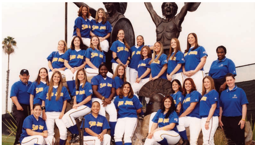
The 2005 Spartans had one of the best pitching staffs in program history. They shutout opponents 22 times, recorded three no-hitters and threw the only perfect game in San José State history.