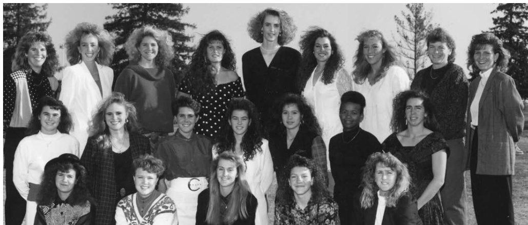
The 1992 Spartans, who competed in the program's second NCAA Regional, had a San José State record 11-game winning streak (Feb. 26-Mar. 15, 1992).