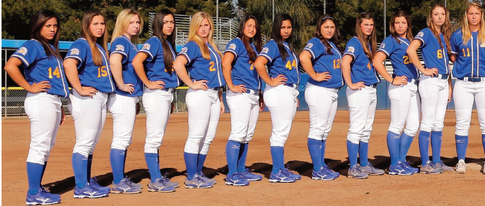
TABLE OF CO