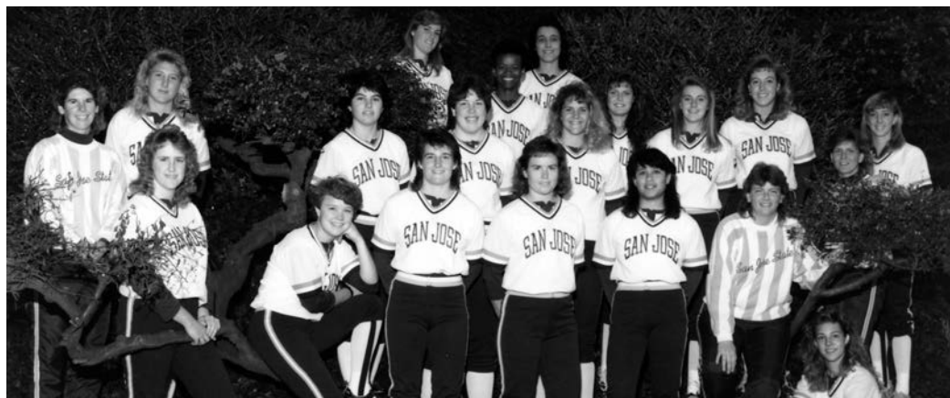
The 1990 Spartans were the first San José State team to advance to the NCAA Postseason. At the NCAA Regional at California, the Spartans were defeated by 2-1 margins by No. 17 UNLV and No. 9 California.