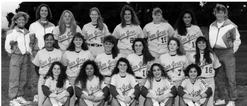
The 1995 Spartans defeated four nationally-ranked opponents: No. 9 Hawai'i twice (11-2 and 1-0), No. 12 Nebraska (6-3), No. 3 Cal State Fullerton (2-0) and No. 20 Cal Poly (2-1).