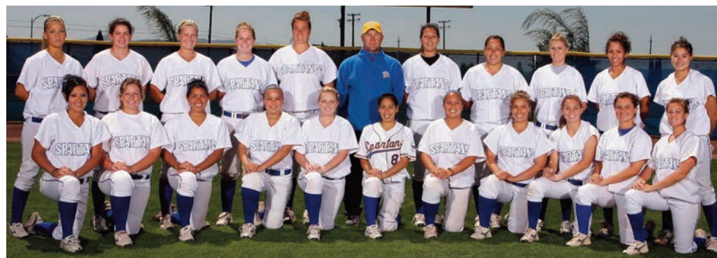
In 2008, Spartan pitchers struck out a program-record 316 batters.