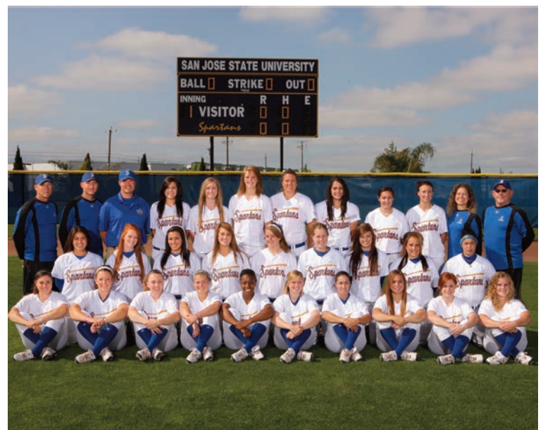
The 2010 Spartans were one of the best hitting teams in program history. The club set 11 records, including batting average (.284), on base percentage (.371), runs scored (304), walks (206) and stolen bases (78). The team finished with a 34-25 (8-13 WAC) record.