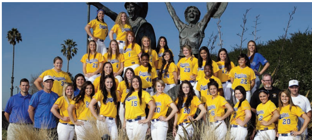
The 2012 San José State softball team beat #16 Stanford, 2-1, on April 18, 2012. Prior to that victory over the Cardinal, the Spartans last defeated Stanford on May 8, 2002, when San José State won the second game of a doubleheader, 1-0, at SJSU Field.