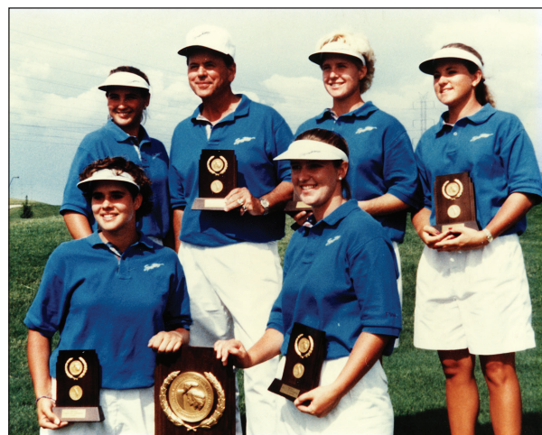
1992 NCAA Champions