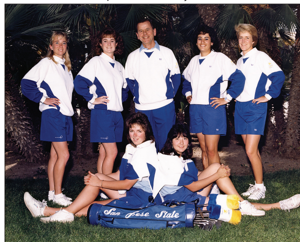
1989 NCAA Champions