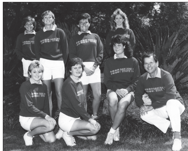
1987 NCAA Champions