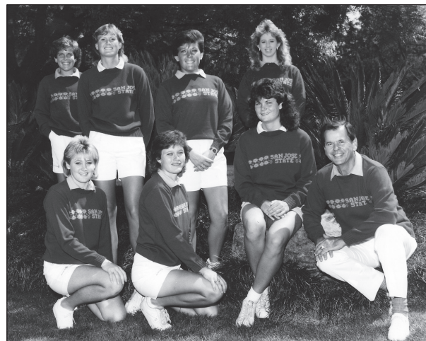
1987 NCAA Champions