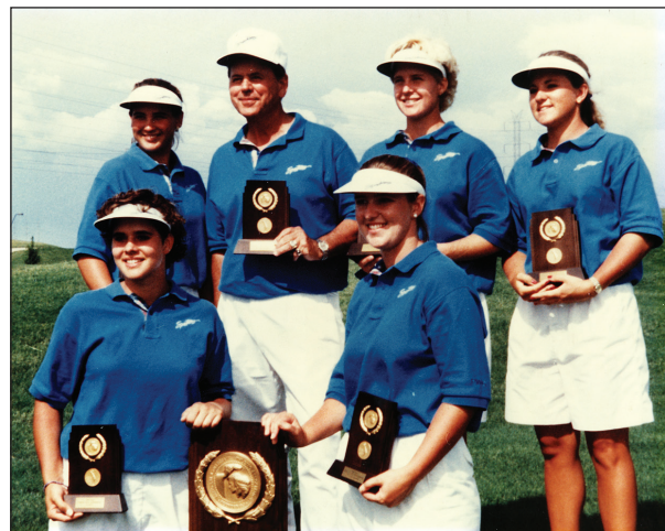
1992 NCAA Champions