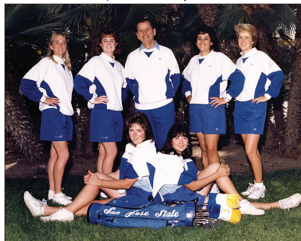
1989 NCAA Champions