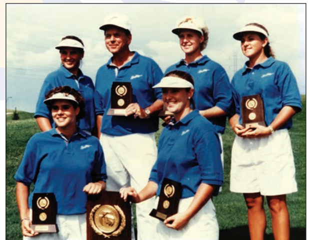
1992 NCAA Champions