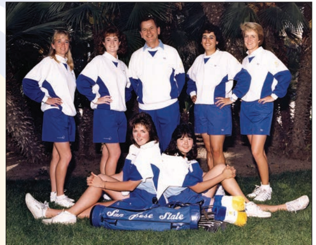
1989 NCAA Champions