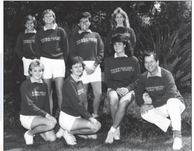
1987 NCAA Champions