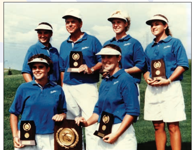
1992 NCAA Champions