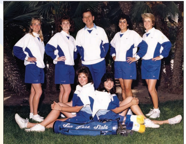
1989 NCAA Champions