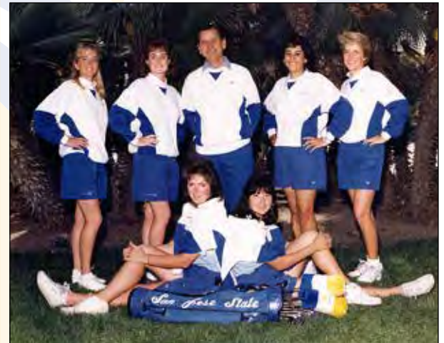
1989 NCAA Champions