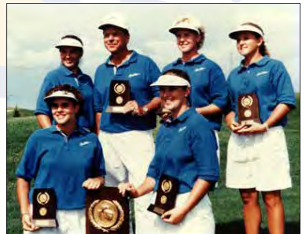
1992 NCAA Champions