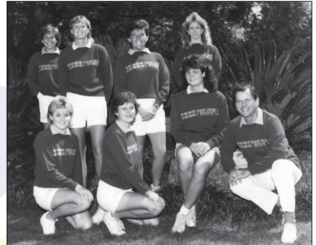
1987 NCAA Champions