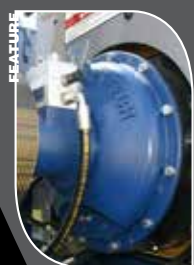
HPTO Wet Clutch