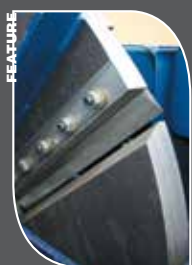
2" Thick Chipping Disc