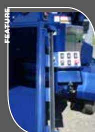
Two Control Panels with Emergency Stop