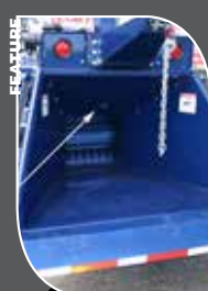
Patented Automated Feed Sensor