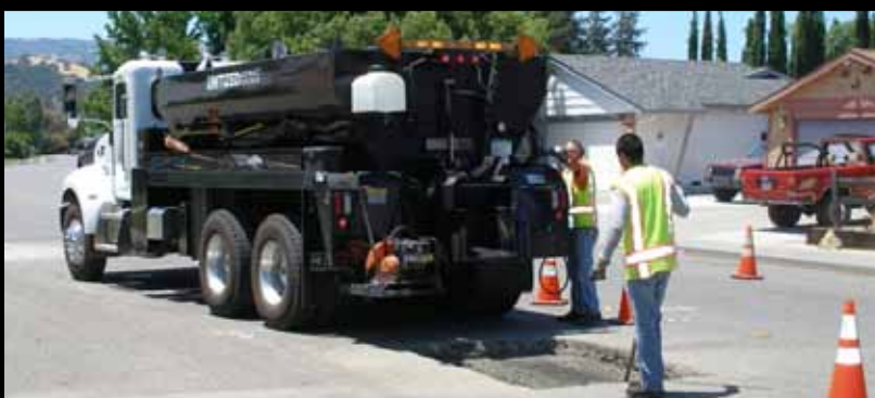
Remove old material, create a firm base and tack the hole edges.

PB Makes Pothole Patching Easy...With One Machine