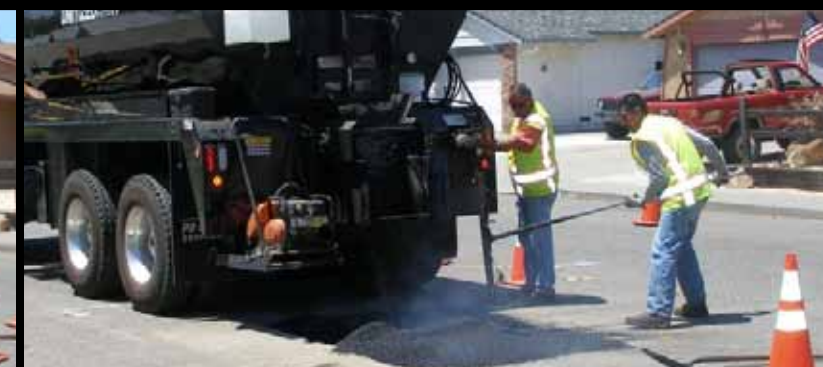
Seal and make a permanent patch!