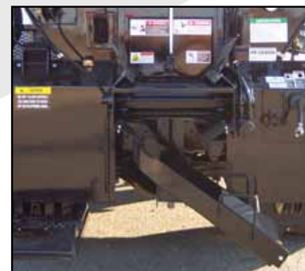
Pivoting Asphalt Chute