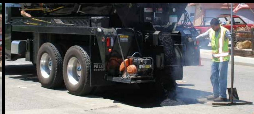
Add asphalt mix.