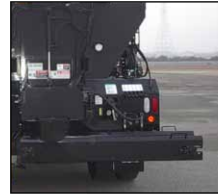
Side Dumping Conveyor