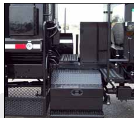
Catwalks for Accessibility