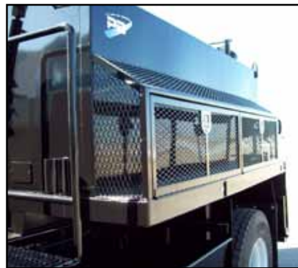
Lockable Tool Basket