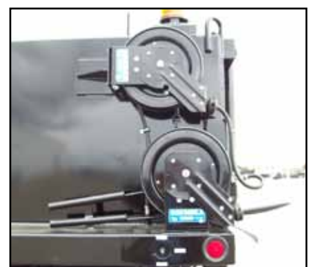
Retractable Hose Reels