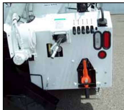
Hydraulic Tool Circuit