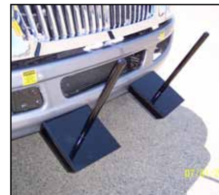
Safety Cone Holders