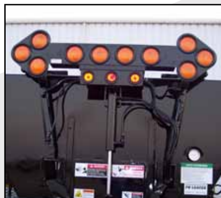
Arrow Board with Bracket