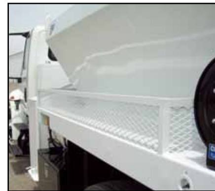
Open Tool Basket