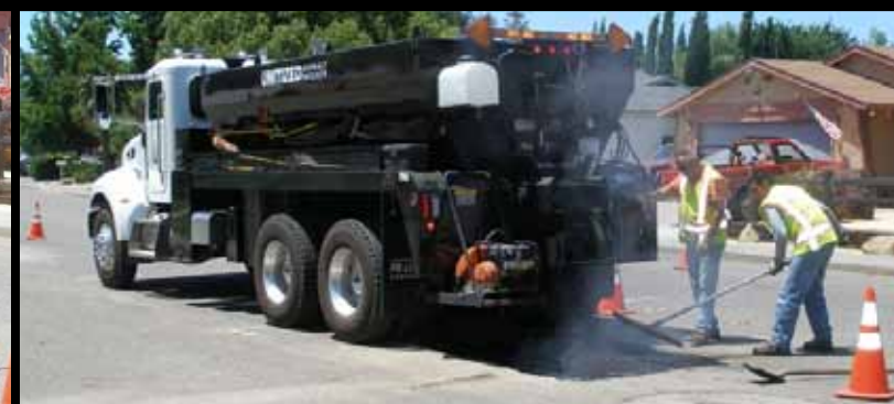
Compact asphalt material.