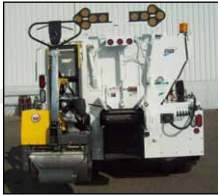
Roller Transport Device