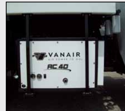
Hydraulic Vanair Compressor