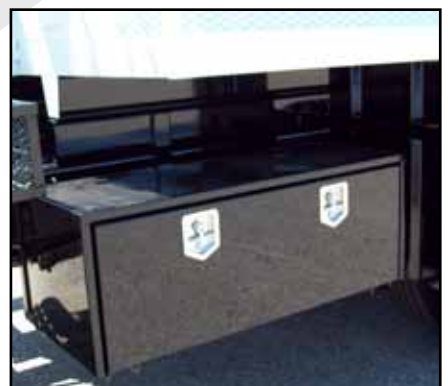
Underdeck Tool Box