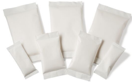
Pouches & Sachets