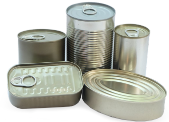
Cans & Tins