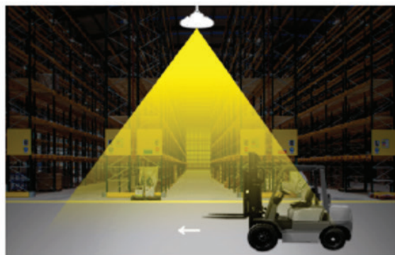
2 With a low light level, the sensor switches on the lamp when motion is detected