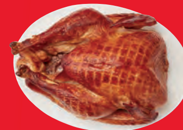
OVEN ROASTED TURKEY