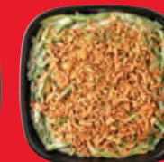
GREEN BEAN CASSEROLE