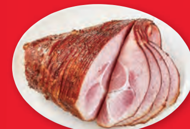
SWEET HOLIDAY SPIRAL HAM